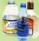
Plastic bottles (necks smaller than base)