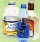
Plastic bottles (necks smaller than base)