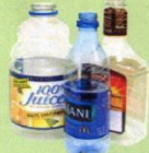
Plastic bottles (necks smaller than base)